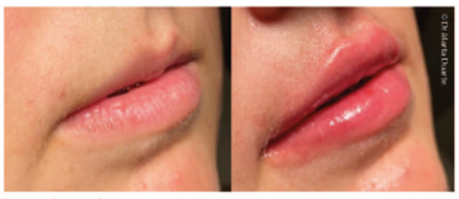
Patient before and after treatment.

For optimal lip augmentation results, it is necessary to maintain proper contour and balance between the upper and lower lips. The golden ratio for female lips is the ratio of 1.0 upper lip for 1.6 of lower lip (for most ethnicities). It is imperative to correct lips while maintaining the natural ratio and proportion. In my experience, a deflating vermilion is one of the biggest patient concerns, comprising of drooping angles of the mouth. More often than not, it is the upper lip that becomes the focus of the treatments rather the lower lip.